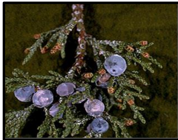
Utah juniper ( Juniperus osteosperma )