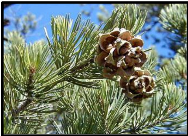
Single-leaf pinyon pine ( Pinus monophylla )

Other species of trees on the district are unique and, or scarce. For this reason, the BLM Ely District prohibits cutting or removing other species of trees for any purpose.