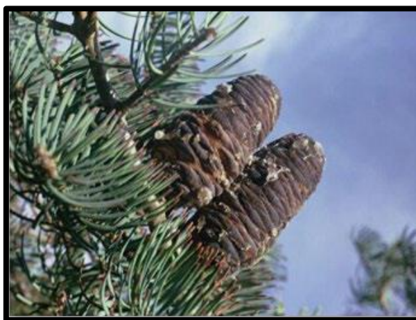
White fir ( Abies concolor )

For more information and photos on these tree species please visit, USDA Plants, https://plants.sc.egov.usda.gov/java/